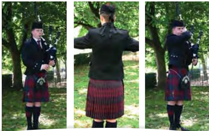
Piper Flex Jacket