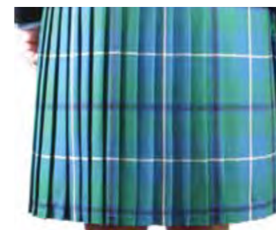
kilt pleated to sett