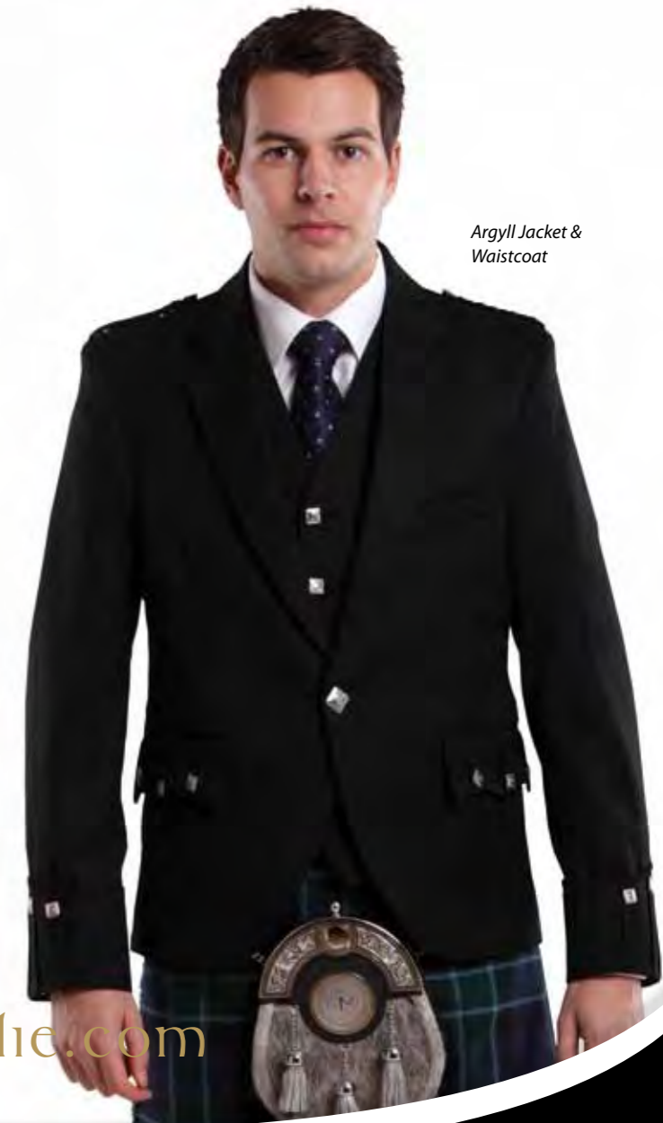
Argyll Jacket & Waistcoat