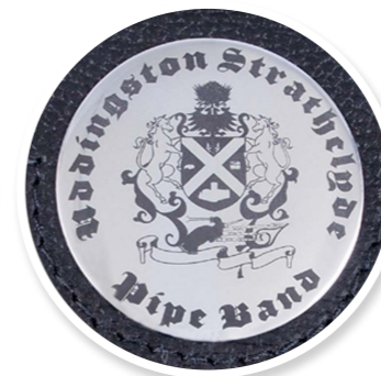
New Laser Etching

For the centre piece please email a high resolution image of your logo to sales@rghardie.com .