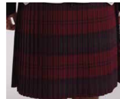
kilt pleated to stripe

We will guide you through the measuring process and we are happy to visit your band practice (UK only) to measure you for kilts to ensure a perfect fit.