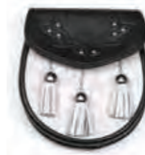
semi dress sporrans