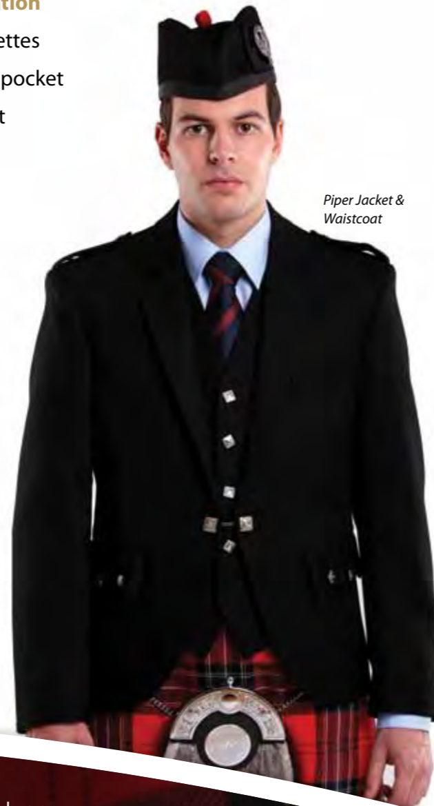
Piper Jacket & Waistcoat