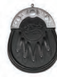
embossed leather sporrans